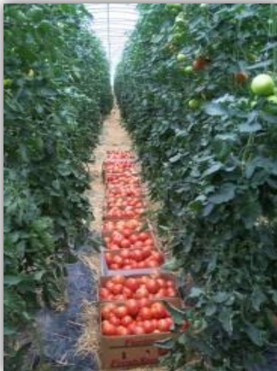
Right: Indeterminate trellis & yield.