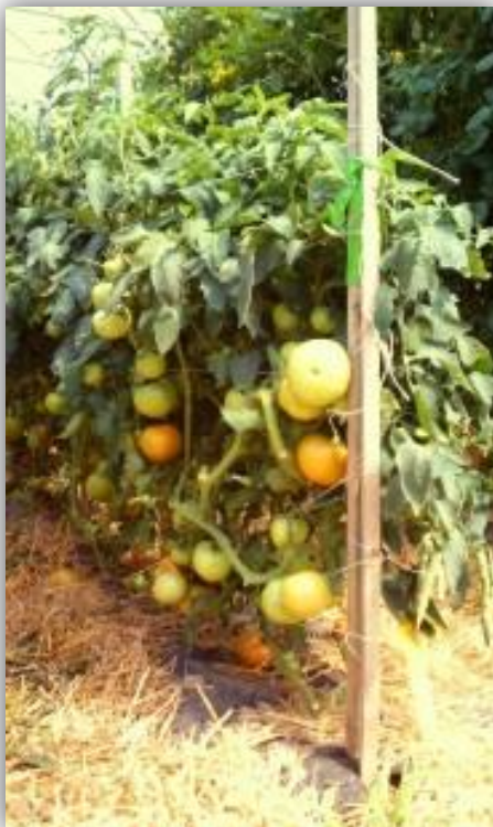
Left: determinate trellis & fruit load.

Yield varies by variety, but there are high yielding varieties in both categories. While we have achieved yields of 30 lbs. per plant with both types in our trials, the timing of harvest is dramatically different. Determinate plants have a more concentrated early harvest of fruit, while indeterminate varieties will yield more evenly over the harvest season. Indeterminate varieties are likely to provide more high quality fruit in the late season than determinate varieties.