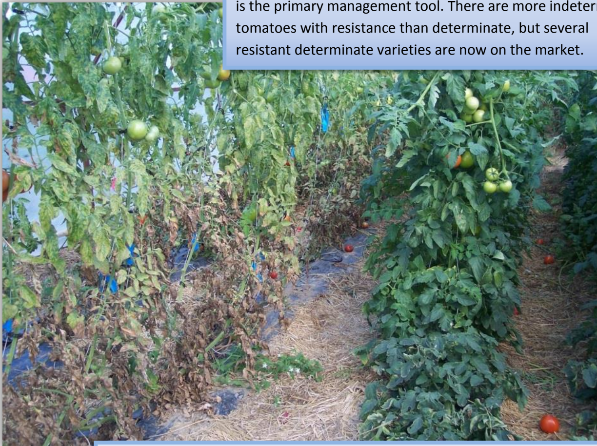
A susceptible variety (left) compared with a resistant variety (right)

The foliar disease of primary concern in high tunnels is Brown Leaf Mold, caused by the fungus Passalora fulva . This disease is more severe in tunnels than in the field and varietal resistance is the primary management tool. There are more indeterminate tomatoes with resistance than determinate, but several resistant determinate varieties are now on the market.