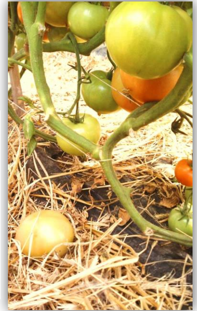
Strong Y pruning of a determinate plant.